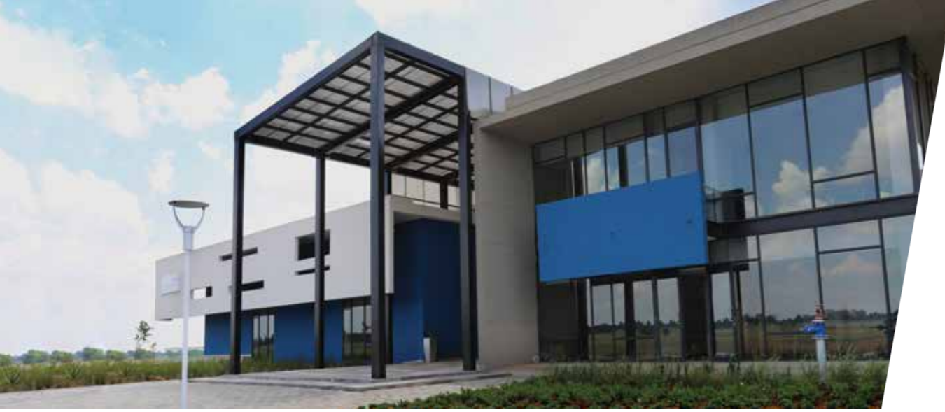
Structural and industrial engineering design. Structural engineering solutions designed for the future.